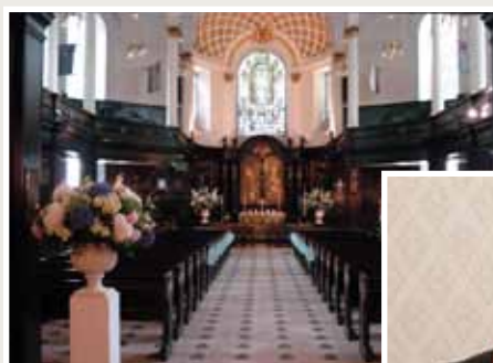
Saint Clement Danes Church