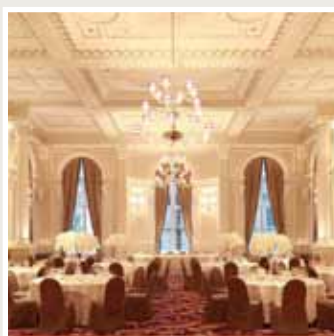
The Corinthia Hotel